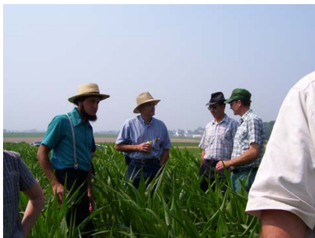
Farmers, including Plain Sect on a Field Walk

The Chesapeake Bay Funders Network (CBFN)* collaborated on a Farmer to Farmer Network Project in Lebanon County, Pennsylvania to link experienced no-till farmers to beginning no-till farmers, through a “mentoring” relationship of networking and technical assistance. This is the first program of its kind in the state to address the peer-to-peer aspect in the farm community. The challenge was to change farming behavior and we did this by increasing interaction among farmers. The goal was to help reverse the lack of adoption of a continuous no-till systems (CNT) approach on individual farms. What we worked to achieve was a way to integrate the value and knowledge of successful CNT systems into an effective farmer-to-farmer networking, training and technical assistance model. This program brought a diversity of people together to learn from one another and develop creative working relationships to incorporate new farming practices.