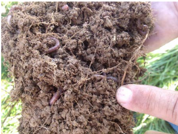
Healthy pasture soils should have good aggregates, vertical roots, and soil life.

When rating this indicator, begin with the primary sub-indicators (compaction layer, then root characteristics) and use