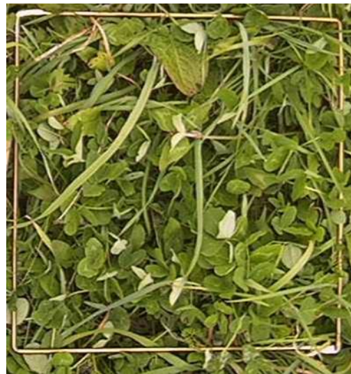
Legumes at 27% by dry weight.