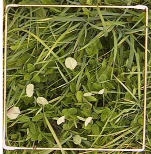
Legumes at 15% by dry weight.

of the plants. For rare cases where legume percentages are greater than 40 percent of the stand, but still are less than 40 percent bloat-type legumes, rate as a 5.