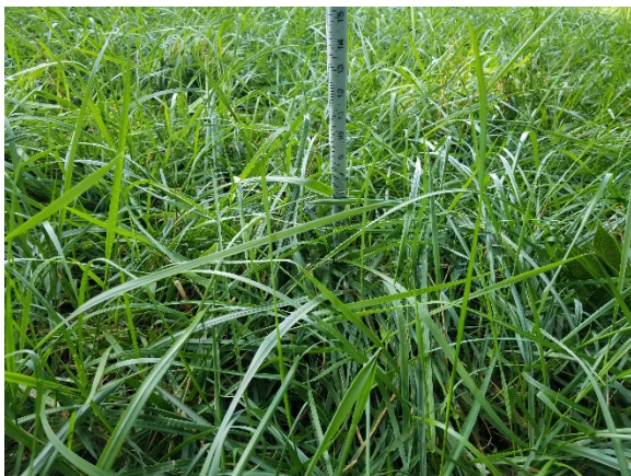
Recovery and forage color are good indicators of plant health.

Leaf color can also change due to age. Older, lower leaves of plants turn yellow as they become more shaded and nutrients are translocated from them to the younger leaves higher in the canopy. This type of progressive vigor decline on a single plant is critical to the producer timing the rotation of livestock from one pasture to the next. In general, color is a visual indicator of either mineral deficiencies or, occasionally, of over-fertilization. Over-fertilization is not separated out in this indicator but should be annotated in the notes when observed and rated a “1” if an issue. Excess applications of nitrogen can cause some major nitrate toxicity issues. A lush, lodged, very dark green to bluish-green grass is indicative of over-fertilization especially by nitrogen. It can also occur where livestock have concentrated on a pasture such as at a permanent water trough or feed bunk. These spot areas are often ungrazed by livestock due to taste, smell, or post-ingestive feedback caused by low level nitrate poisoning.