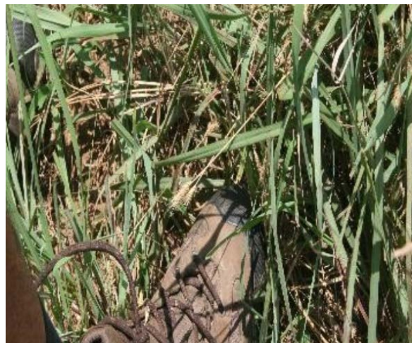
Step point method can provide data for five indicators.

PCS involves the visual evaluation of 10 indicators, listed and described below, which rate the pasture vegetation and soils. Rating subjectivity can be reduced by incorporating quantitative measures. For example, using the step-point method for evaluation provides measured results for five of the