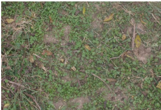
Estimate the amount of bare soil. When bare soil is easily seen is rated a 1.

First assess the amount of bare soil. Cover is easily assessed during step point by gently moving the above ground plant cover to one side with your hand or foot if needed to see if cover is