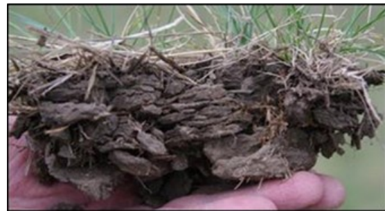
Compaction is one of the most detrimental resource concerns.

Soil regenerative features focus on the condition of plant roots and the abundance of soil life, both of which can improve important soil attributes like structure and organic matter. Soils with roots growing deep and downward have the potential to feed a large and diverse population of soil life. These soil organisms can improve water-holding capacity, nutrient cycling, plant productivity, plant health, and nutrient density.