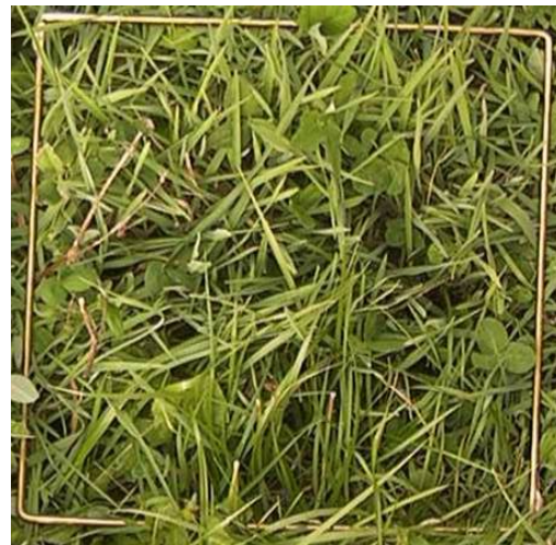
Legumes at 6% by dry weight.

Legumes are important sources of nitrogen for pastures and improve the forage quality of the pasture mix when they comprise at least 20 percent of total air-dry weight of forage. Deep-rooted legumes also provide grazing during hot, dry periods in midsummer.