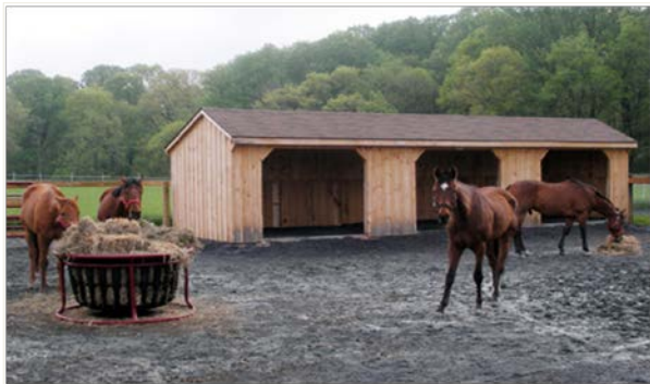
The Animal Concentration Area (ACA) should be built with animal comfort in mind.

Additional steps may be required to give grasses adequate rest. During hot, dry weather, when grasses are stressed and growth is limited, pasture access should be restricted. Areas designed to confine animals that have little to no vegetation are known as Animal Concentration Areas (ACA). These areas also are known as sacrifice lots, barnyards, exercise paddocks, dry lots, or heavy use areas.