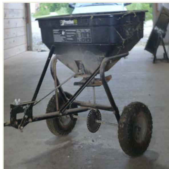
A basic pull – behind spinner spreader works well for applying fertilizer and lime to small acreage pastures.