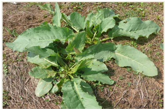
Curly dock, pictured above, is a perennial weed that competes with grasses and reduces pasture forage quality.

Since winter annual weeds are present in spring and fall, when cool season grasses are rapidly growing, it is rarely necessary to control these weeds. Healthy pasture grasses should be able to prevent the germination of winter annual weed seeds and reduce the survival of any seedlings. If pasture growth is poor and the elimination of winter annuals is warranted, the best time to apply herbicide is late summer, after the weed seeds have germinated.