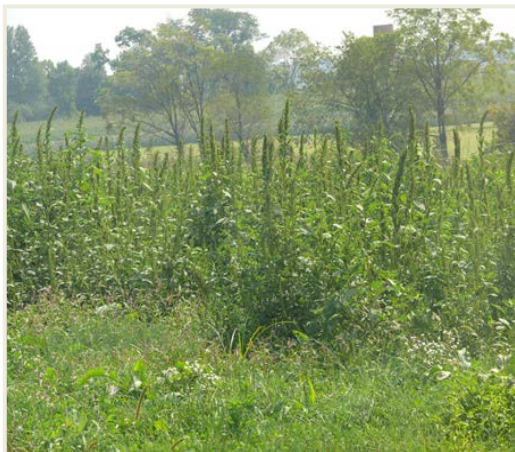
Mowing pastures not only encourages tillering, but also reduces weed populations by preventing seed head formation and limiting new generations of weeds.

Mowing at the proper height is an important component in maintaining the health and survival of pasture grasses. Grasses store their energy reserves in the bottom few inches of the plant, so mowing too low reduces their reserves and the ability of the plant to re-grow. When mowing, maintain a forage height of 2 to 3 inches if the pasture is composed primarily of fine bladed short grass species, such as perennial ryegrass and bluegrass. For taller, higher yielding species such as orchard grass or timothy, mow to maintain a slightly higher level of 3 to 5 inches.